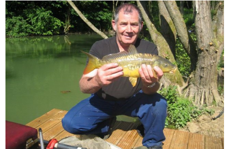
A Woodland Lake Mirror Carp