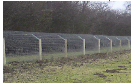
North House Lake Otter Fence