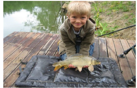
A Woodland Lake Common Carp